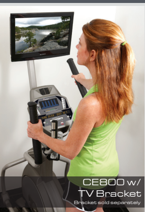
CE800 w/ TV Bracket Bracket sold separately

This model is very appealing to users that value a smooth stride and a weight bearing workout, without the impact. The console is identical to the CR800 & CU800 bikes, which makes programming very familiar when using any of the Spirit Fitness C series products.