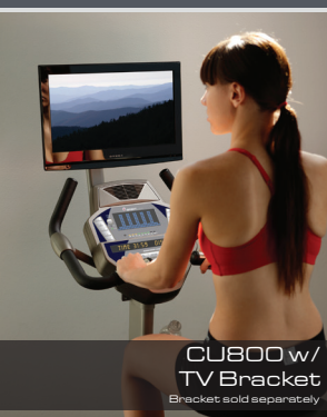
CU800 w/ TV Bracket Bracket sold separately

This model is very appealing to users that value a smooth ride and extensive data feedback. The console is identical to the CR800 fitness bike & CE800 elliptical trainer, which makes programming very familiar when using any Spirit Fitness C series products.